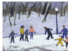
Skating in GCP 2007

Last year the weather did not cooperate with our skating enthusiasts. On January 14, 2009, Essex County Park System had the pond cleared of snow and open for skating! This is very exciting for everyone!