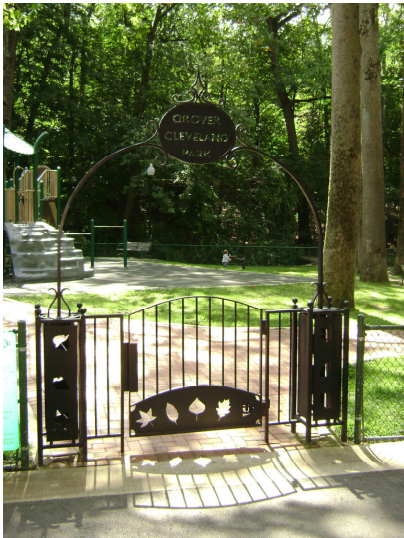
The lovely gate paid for by a grant from Starbucks.