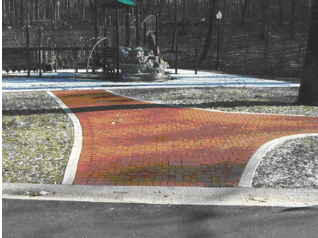
The walkway before the gate or any personalized pavers.

The last bricks will be placed in the spring after the ground thaws.